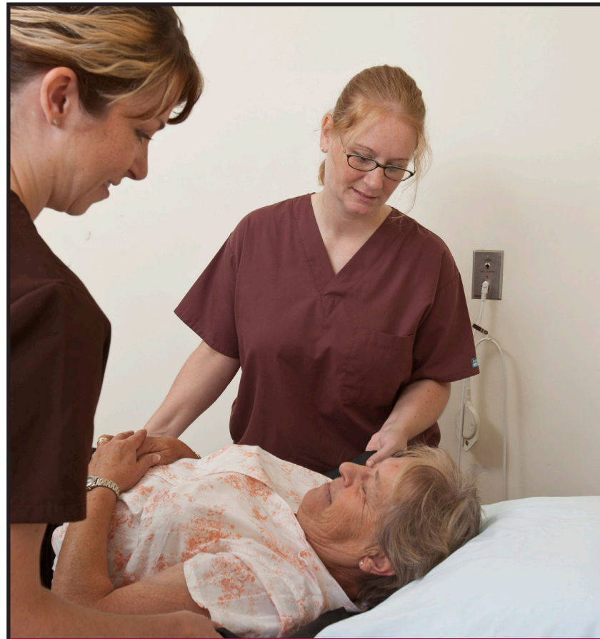
Pull, Don't Lift