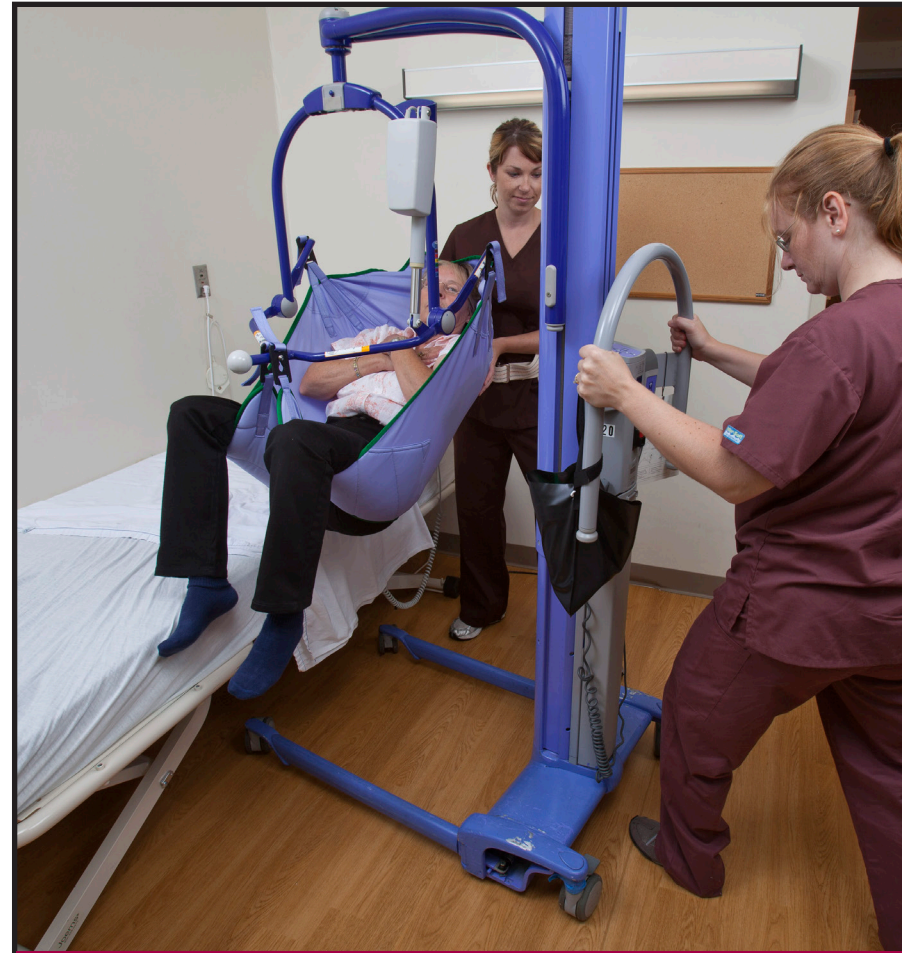
Pull, Don't Lift